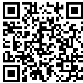
A3 Black & White